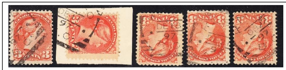
-/? 9/97 -/DE 11/97 -/DE 18/97 -/DE 21/97 -/OC 22/97 (S1)

Rick Friesen added the following comments/information on these Kaslo strikes: