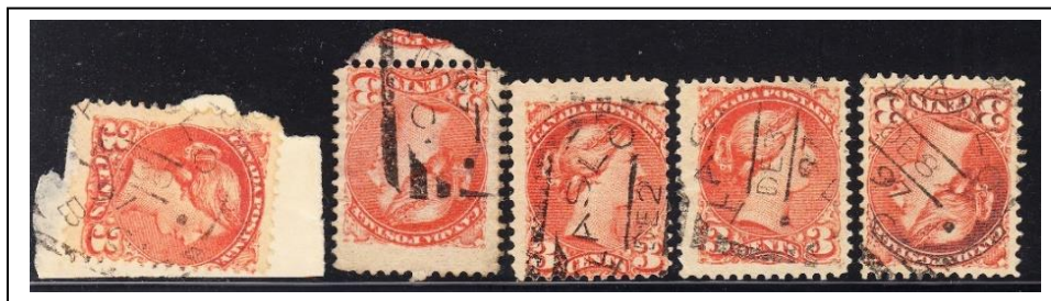
-/NO 30/97 -/?E 2/97 -/DE 2/? -/DE 3/97 -/DE 8/97

The last strike in the scan is -/DE 22/97 and so is a new LRD for S2. Thus, given the numbers in the handbook there are at least 15 S2 Kaslo BC strikes.” (Note: The -/DE 22/97 strike was subsequently identified as -/OC 22/97 which is a S1 strike.)