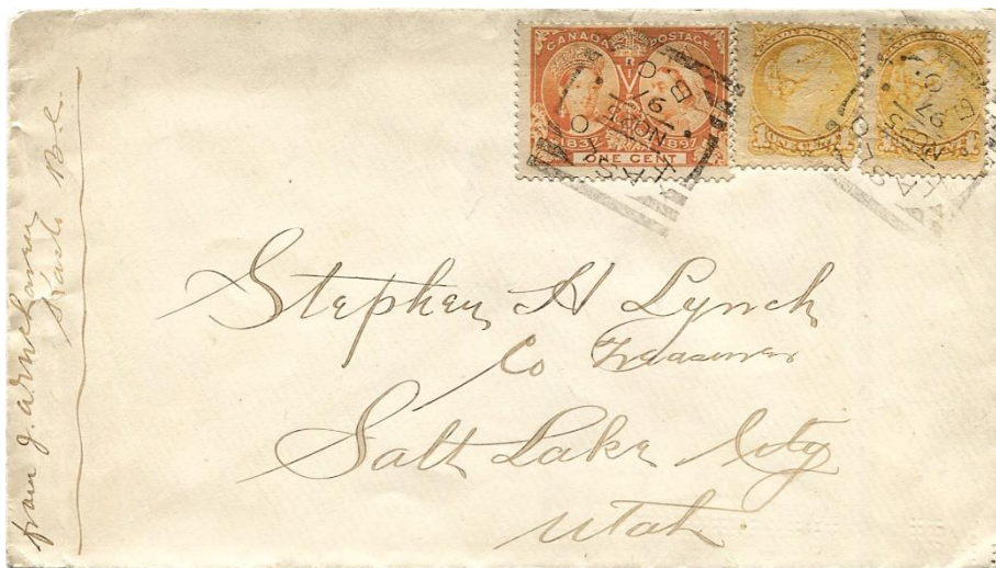
Figure 3. Kaslo State 1 (-/NO 25/97) to Salt Lake City.

Figure 3 shows a cover from NO 25/97. The corners are still sharp. [I also have a strike on a 1 cent Jubilee cover dated NO 17/97 with sharp corners.] The cover in Fig. 3 has the latest strike of the first state of the Kaslo hammer that I have seen.