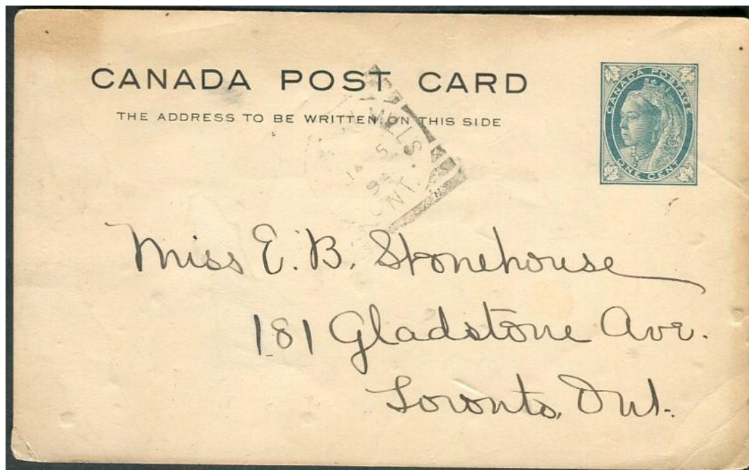
Scarce Lambton Mills, ONT Strike on Cover/Card (1 of 2 known) -/JU 9/99