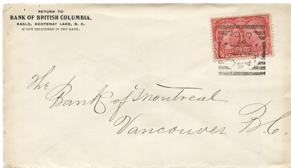
Figure 2. Kaslo State 1 (-/SP 13/97) to Vancouver

The corners of the hammer could have become worn over time. However, the change in the strikes of the Kaslo hammer was abrupt and can be narrowed down to a period of just over a week. The hammer was deliberately altered, and so two states exist. A clear strike of the first state of the hammer from SP 3/97 is shown in Figure 2.