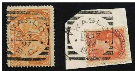
Figure 4. Kaslo State 2 (-/DE 3/97) and (-/DE 17/97)

The hammer was altered between Nov. 25, 1897 and Dec. 3, 1897. Figure 4 shows strikes from DE 3/97 and DE 17/97, both with rounded corners.