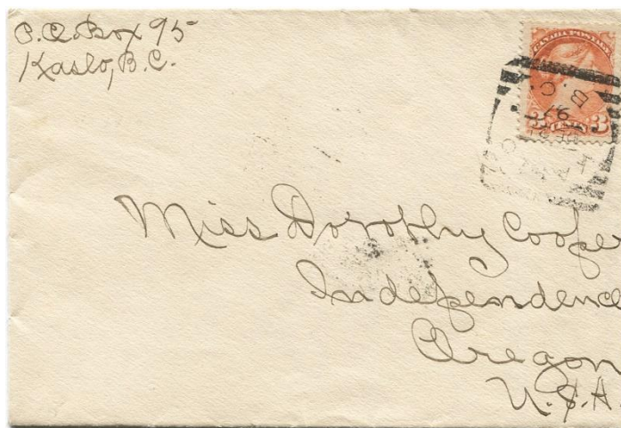
Figure 5. Kaslo State 2 (-/DE 21/97) on cover to Independence, Oregon.

Figure 5 shows a DE 21/97 cover mentioned by Jack Gordon in RA-101. The corners are rounded.