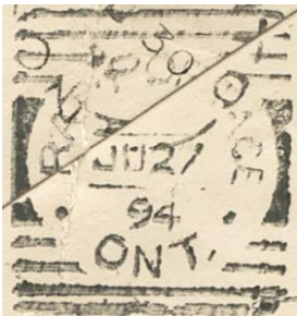
Figure 2 -/JU 27/94