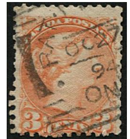
Figure 3. -/OC 27/94

All strikes I am aware of from July, August, September and October show the correct year "94." Figure 3 shows a strike from OC 27/94. Strikes from OC 29/94 and OC 31/94 with the correct year also exist. Hence it appears that from late June to the end of October 1894, the correct year was the norm. HB5 notes that the error occurred in August, but I have been unable to find a report or an example. I have seen multiple strikes from throughout August with the correct year.