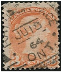
Figure 1. -/JU 18/64

The year indicia were inverted in strikes of the Rat Portage squared circle hammer during part of 1894. The year shows as "64" instead of "94". An example is shown in Figure 1.