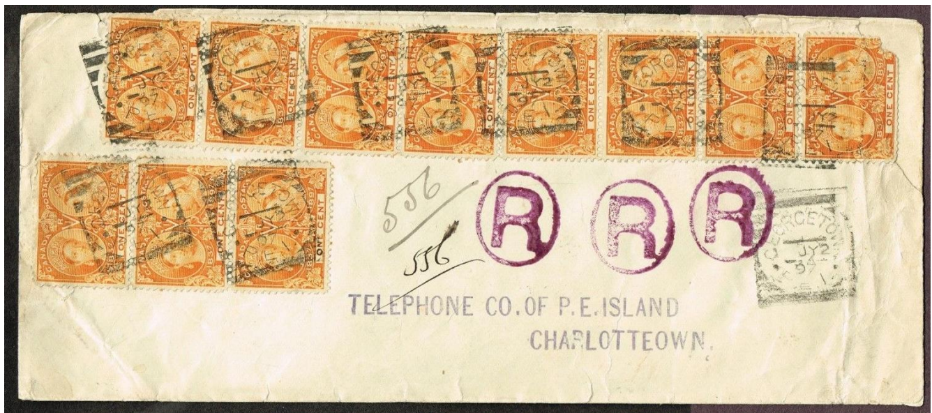
GEORGETOWN, PEI – A cover with 11 strikes of the Georgetown hammer (front and back) and a backstamp strike of the Charlottetown, PEI squared circle; Georgetown strikes are dated -/JY 2/97.