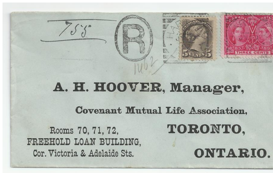
HARTNEY, MAN – Strike dated -/JY 10/97 with Souris & Winnipeg No. 2 RPO with same date East/JY 10/97. (Back of cover below)