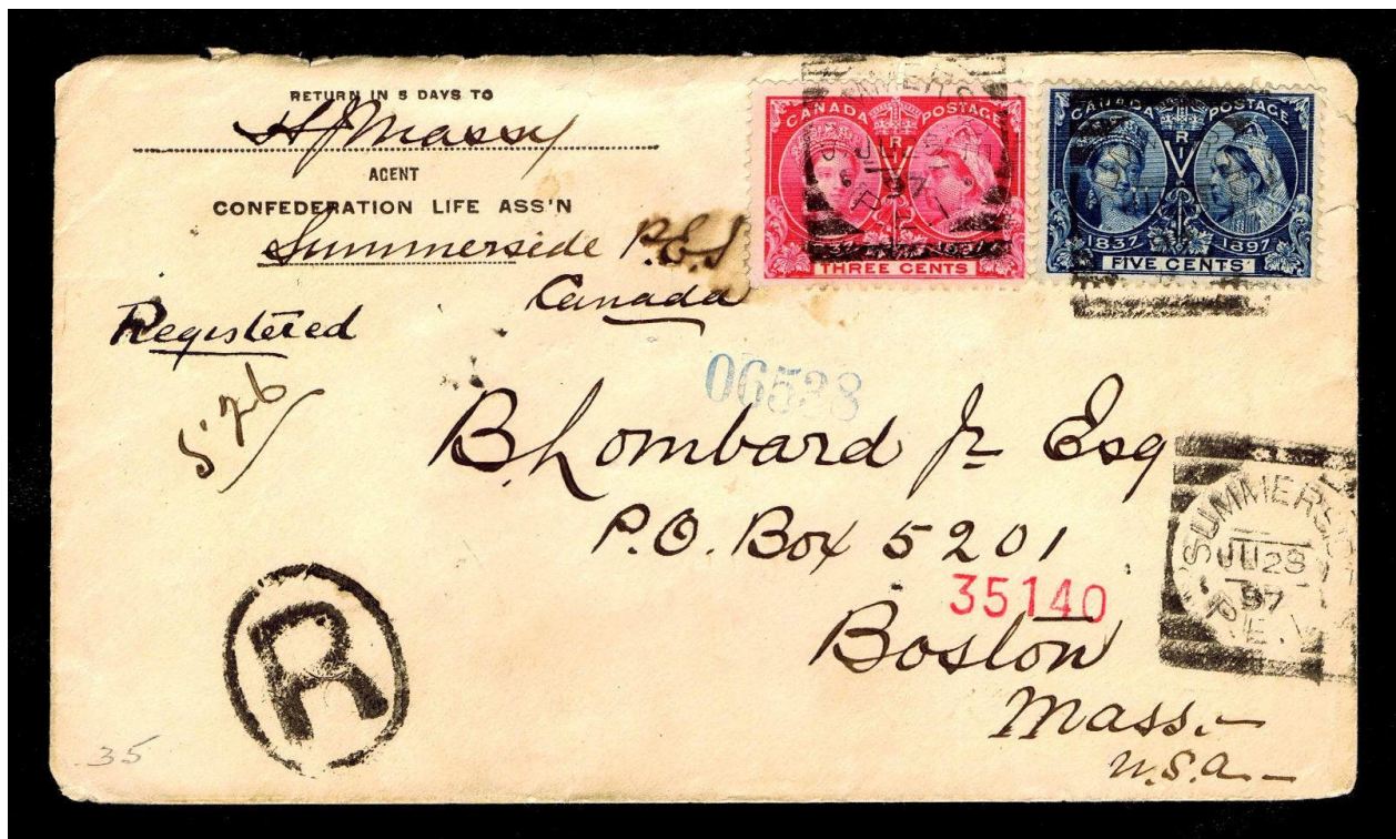
SUMMERDSIDE, PEI – “This cover is unique, having both the 3 and 5 Cent Jubilees. Inventory is low on stamp and supposedly on two covers.” (Joe Smith)