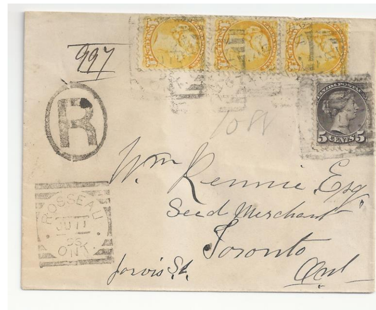
ROSSEAU, ONT – With seven strikes dated -/JU 11/96; (Back of cover below) (From Bill Pawluk)