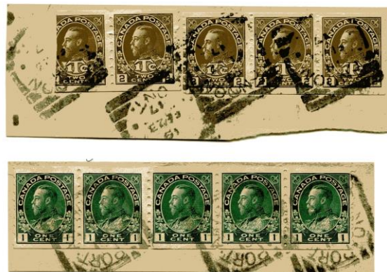
LONDON, ONT. (TOP) 18/FE 23/17 PORT ARTHUR, ONT (BOTTOM) DATE NOT CLEAR