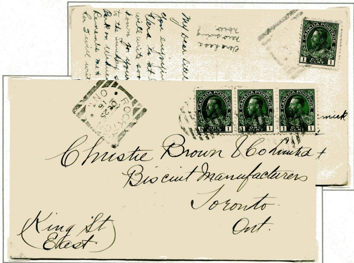
Top: Earliest Admiral Period Use Bottom: Latest Admiral Period Use