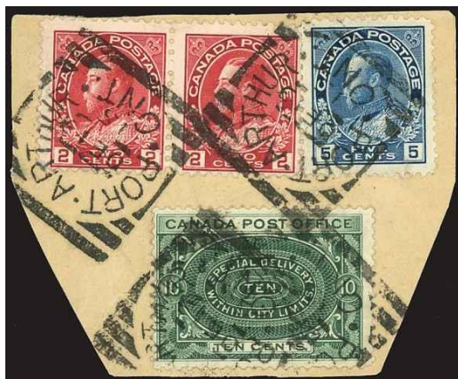
PORT ARTHUR, ONT. -/DE 19/15

Below and on the following pages are strikes of squared circle hammers during the Admiral Period; the last two pages of this Annex are selected pages from my exhibit of squared circle strikes of the Admiral Period.