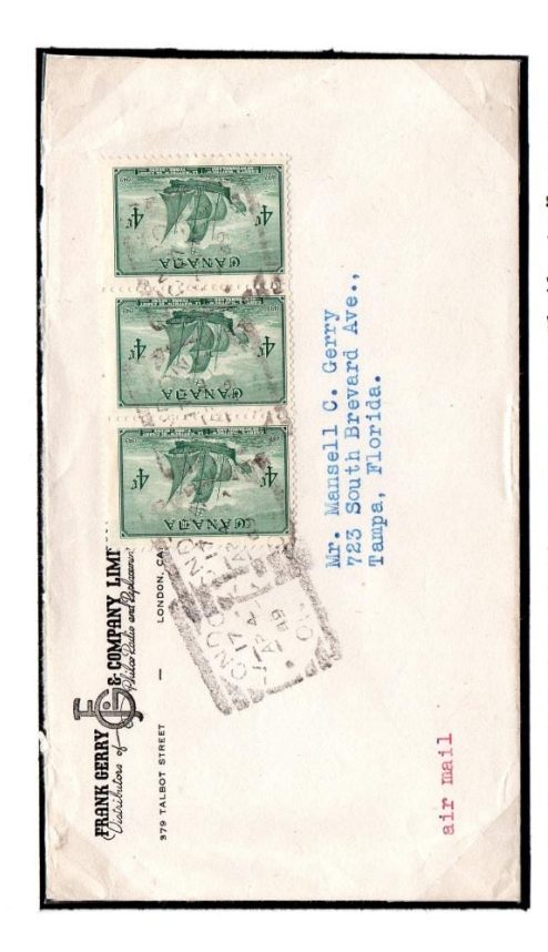
London, Ont cancel ties strip of 4c stamps on cover to Florida - April 4, 1949.