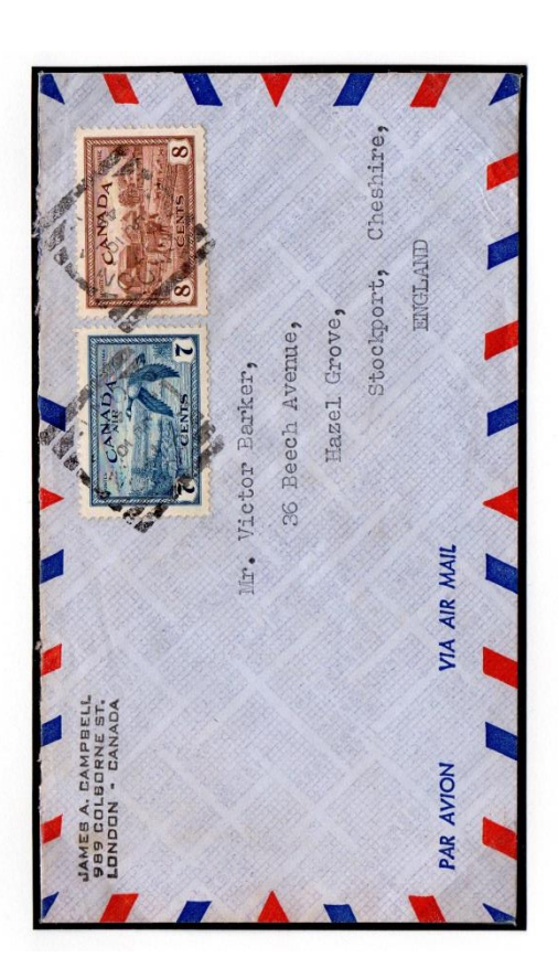
Cover sent to Cheshire, England, bearing 8 cents peace issue and 7 cents air mail issue tied by London squared circle - June 10, 1949.