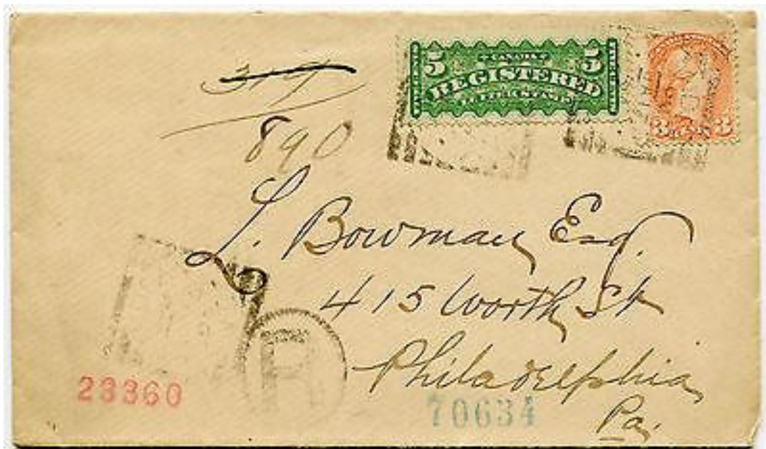
First reported strike of LINDSAY, ONT. on 5 Cent Registered Letter stamp, dated PM/JA 17/94

VICTORIA, B.C., HMR 1 – Strike dated -/AP 11/94 on 2 cent postal stationery; unreported blank time mark and unreported on 2 cent envelope.