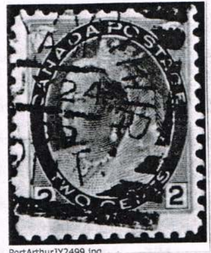
Port Arthur Y2499. inc