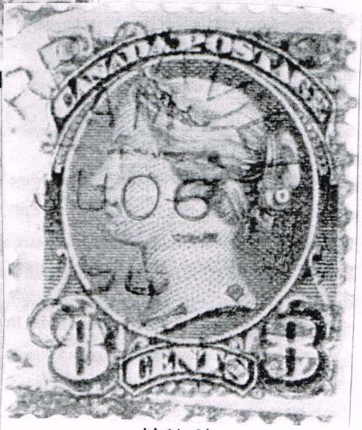
JU 06 96