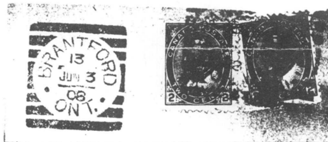
BRANTFORD, ONT. - 13/JUN 3/06