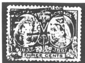
PORTAGE LA PRAIRIE, MAN. -/NO 6/97