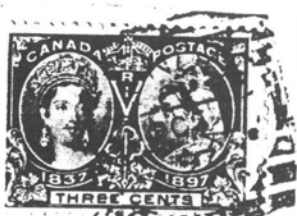
LONDON, ONT. TYPE TWO -/OC 5/97

Emerson Clark reports finding the second example of a PORTAGE LA PRAIRIE, MAN. on a 3 Cent Jubilee; the strike is dated -/NO 6/97. Note that this date coincides with the last day of use listed in the Handbook.