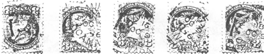
11, 14, 16, 17, 18 / OC 9/95 (YEAR INVERTED)

My next concern is of more major import. The latest (date) for the 1st period is given as October 9, 1896 . I beleive this is totally fallacious and comes from misreading an error made in the indicia on October 9, 1895. Referring to the illustrations below, we show a group of five different time marks - 11, 14, 16, 17, 18/OC 9, 95, wherein the year '95 is inverted to give the appearance, at first glance, of '96; however, close inspection confirms the inverted '95 in all five strikes. Our position on this is further supported by the fact that we have no non-inverted (normal) strikes on this date and further, strikes on October 8 and 10 all have regular '95.