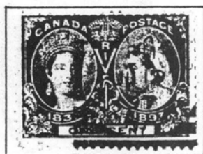
St. John, N.B.