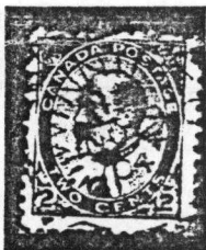
DON FRASER'S WINNIPEG 1V. NO 2? / 04.

Backstamped with WINNIPEG circle date cancel, JY 2 ? 94.