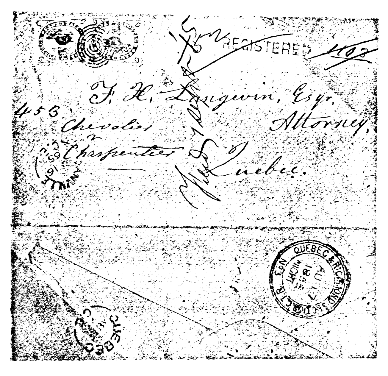
Two 5¢ Beavers, double rate REGISTERED, from DANVILLE, C.E., AU 16, 65, to Quebec, via QUEBEC & RICHMOND SECTION G.T.R. / N ^{\circ} 3 AU 17, 1865, NIGHT

Receiving mark - QUEBEC, C.E. - AU 17, 65