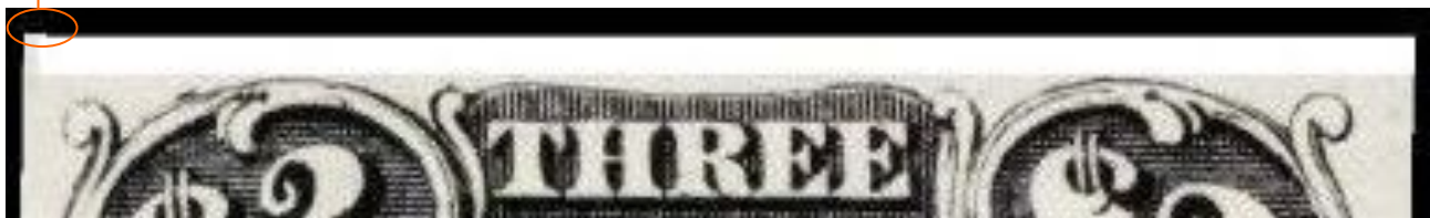
Top margin from new listing of three. Area of top margin appears cut the same circled in orange.