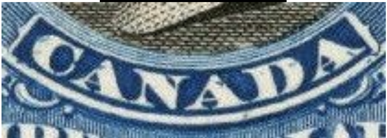
Fig. 2 The main evidence on this proof is in "BILL STAMP" and "CANADA". This is Ralph's re-entry #1.