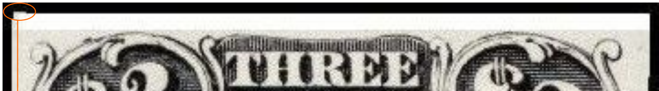
Top margin from the original group of five.

These three proofs are identical to three of the proofs already shown in the image of the five proofs I had bought. For example the black and brown proof has an identical top margin see detail in figure 6.