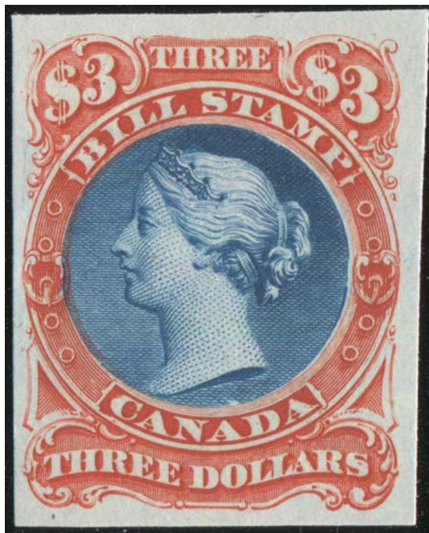
Fig. 11: FB 36P, Red + Blue center. Trimble's description:

I could go on showing the differences between the eBay images and the fake proofs but I feel the point has been made that I did not get what I expected. I will show a couple of genuine proofs from my collection to illustrate how clearly printed the proofs are (Figs. 11 & 12).