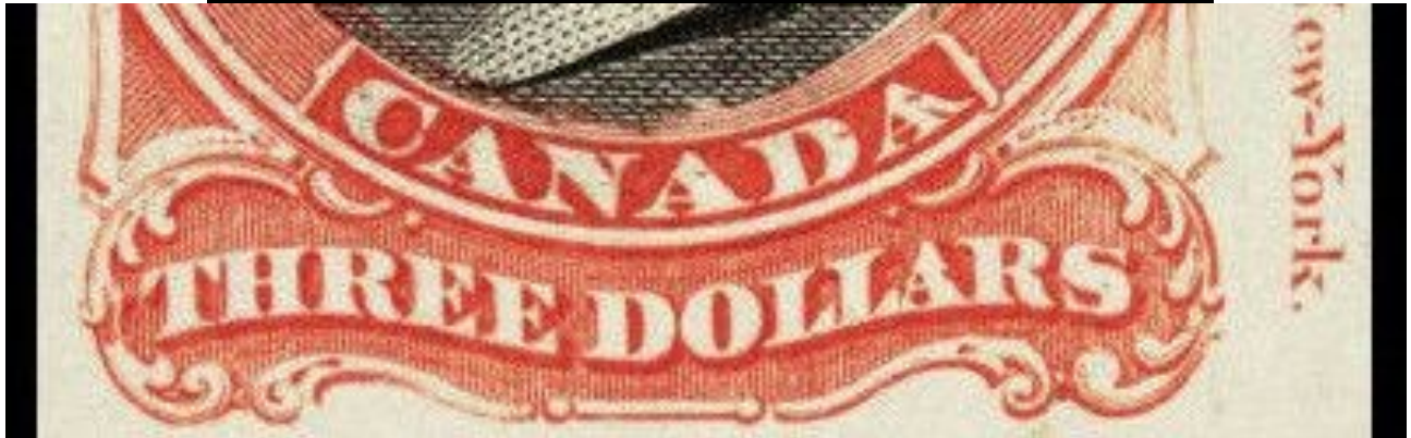
Fig. 4 Re-entry can be seen in letters of "CANADA" and "ARS" of DOLLARS. This is Ralph's re-entry #7. Interestingly this proof was not included in what I recieved.