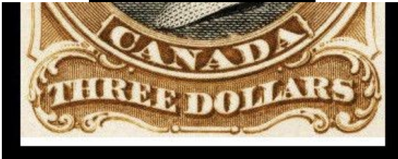
Fig. 1 The letters of "CANADA THREE DOLLARS" show re-entering. This is Ralph's re-entry #13.