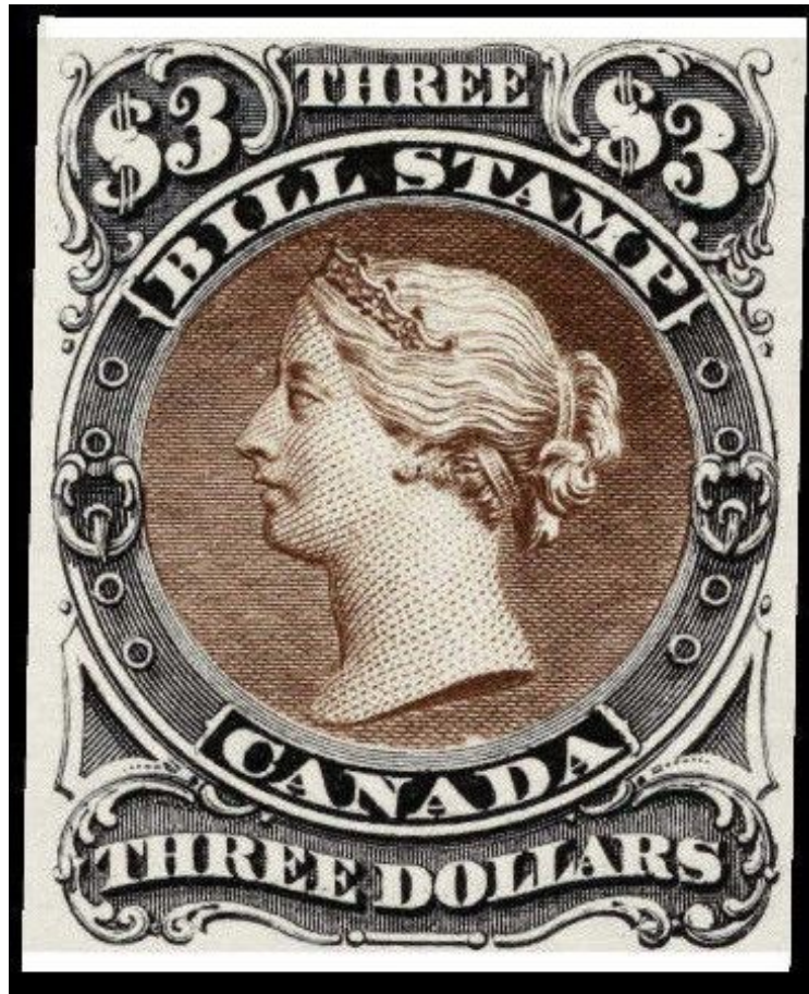
Fig. 3 The marks in "MP" of STAMP define this re-entry. This is Ralph's re-entry #13.