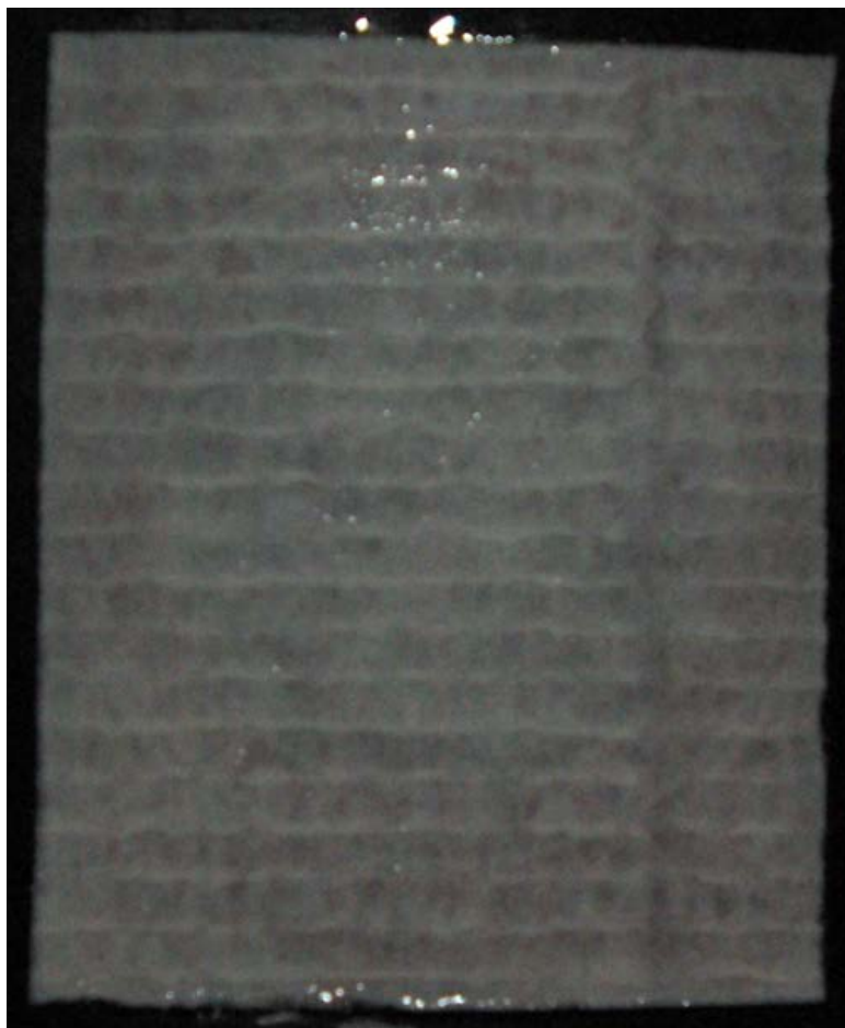
Fig. 15 Back view of brown frame black center fake.

The fake proofs paper thickness measures from .00545” to .00575” so the paper is much heavier. The paper of the fakes also appears to be laid paper (Fig. 15).