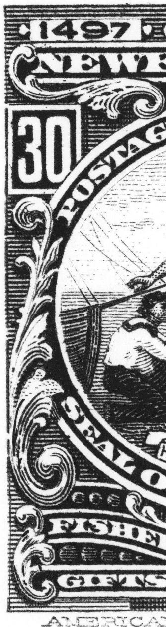
Figure 2 A STUDY GROUP OF THE BRITISH NORTH AMERICAN PHILATELIC SOCIETY 2