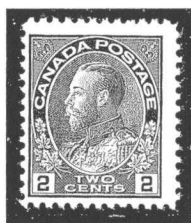
Plate 228 LL, Position 85

Significant Re-entry: Doubling in the left numeral box of the horizontal lines, some letters of TWO CENTS, the ends of 6 or 7 horizontal lines at the top of the lower left spandrel, the outside oval band opposite leaf 4 in the lower left, of both sides of the frame and of the vertical line in the upper right spandrel.