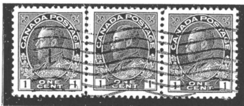
Plate 74UL, Position 6 (Middle Stamp)

Type R10. The lower left frame junction line is broken below the top of the spandrel and the vertical line of left numeral box has two weak spots near the bottom.