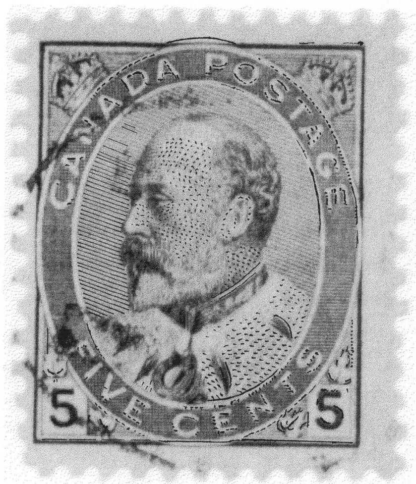
Unitrade Canada Specialized Catalogue Number 91