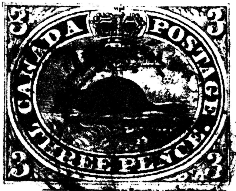
Plate position A 91 of the 3d Beaver shows pronounced doubling of upper left outer frame, doubling of upper left 3, a fine line between frames above lower right 3 and traces of colour in the other 3s. There are very obvious extra colour dots in "EE PENC"