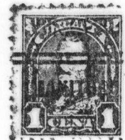
#151 Winnipeg Type 3