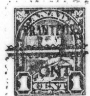
#143 Brantford Type 3