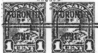
#151 Toronto Type 11 Bottom right stamp