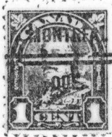
#143 Montreal Type 7