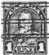
#143 Type W