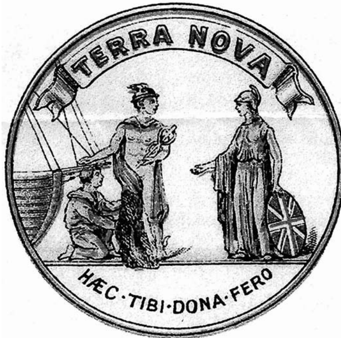
The Great Seal of Newfoundland - 1827