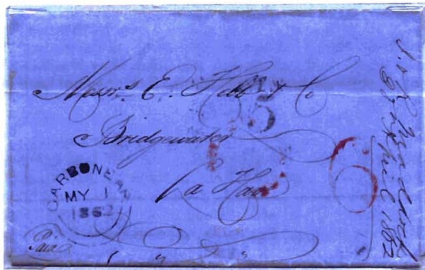
St. John's Carbonar May 1 st 1862

Note: The Carbonar Postmaster has only struck a 6 Pence Rate Handstamp thus showing ½ Penny underpaid. However, there were no 6½ or ½ handstamps available in Newfoundland and the Postmaster merely omitted marking the ½ Penny in manuscript. He did use his circular Carbonar Paid Handstamp in red to indicate it was paid to the first port in Nova Scotia, in this case Halifax.