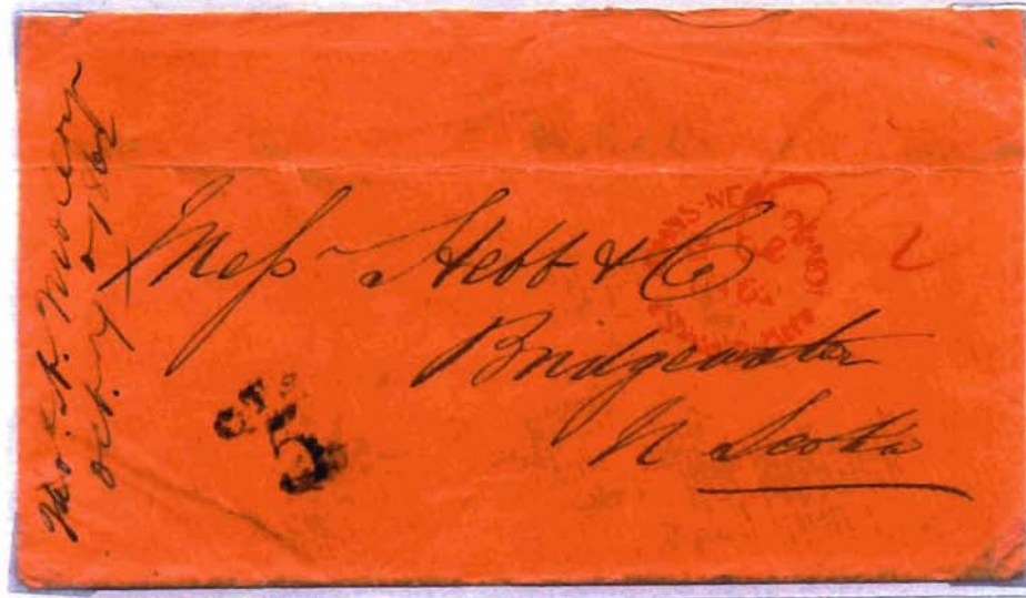
Way Office October 7 th 1862

Nova Scotia Internal Rate Collect Fee 5 Cents Per ½ Ounce