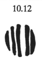
5 Bar Circle