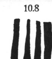
4 Parallel Bars