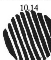
Thick 9 Bars