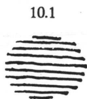
10 Bar Oval

The last page of David Pigg feature on the 8 other Canees on First Canees