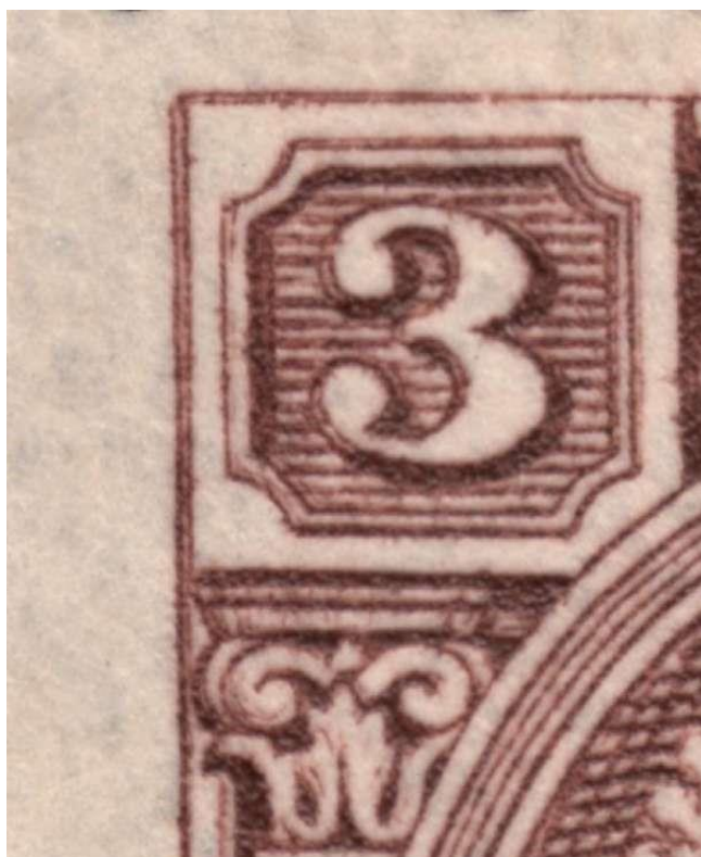
Unitrade 147 - This is an unlisted Re-entry that shows a clear doubling of the upper left 3 and surrounding numeral box.