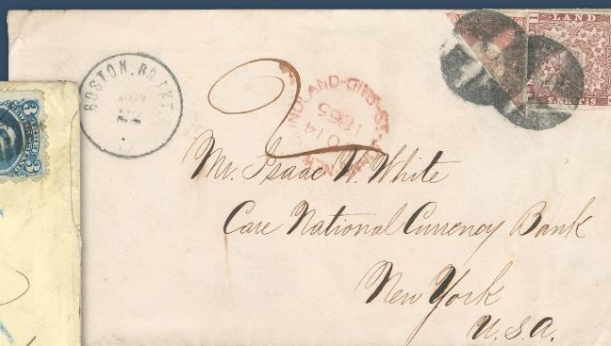
The magnificent pence bisect cover mailed during the interim decimal period to U.S.

Presenting the comprehensive Newfoundland postal history collections, formed by Colin Lewis. Spanning from early mails to the turn of the century, it features domestic mail, ERDs, rates to B.N.A. Provinces, United States, United Kingdom and beyond, along with incoming mail. Collectors will be delighted to find a remarkable showing of early unpaid and prepaid mails, letters from the French Shore, an in-depth coverage of Decimal period to the late 1870s, among other areas. Numerous rarities are present – often these being the very first time we have had the pleasure to offer.