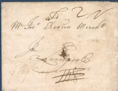
1709 August folded lettersheet from St. John's to Liverpool - the Earliest Outgoing Mail from Newfoundland, in private hands, bearing postal markings.

Visit our Website for auction details & previews