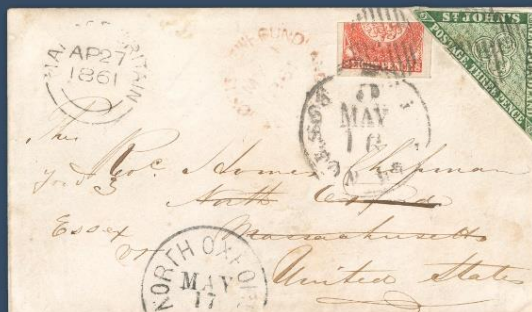
A fabulous 6½-Pence Newfoundland inland to U.S. port packet rate with bisected franking, one of only four recorded.