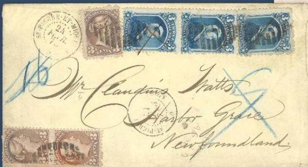
Exceptional cover from St. Pierre & Miquelon with double franking - Canada Small Queen & Newfoundland Decimal stamps, a unique franking.