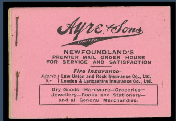
The rare first issued complete booklet (BK1)

A nice selection from first issues to KGVI era including pioneer airmail stamps. One of the very best Newfoundland revenue collections to be offered- Inland Revenues including specialized perfin cancels, rare documents from Queen Victoria to the later Caribou series. Other revenues are also being offered including the unique 1927 Transportation mint set of three, 1938 Beer Stamps including the only reported perforation variety.