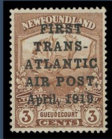
1919 Hawker Flight, an exceptional mint example of the famous first transatlantic flight stamp; 2023 BPA cert.

Visit our Website for auction details & previews