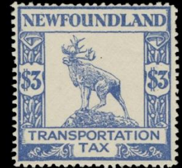
The unique mint set of Transportation Tax stamps; hailed as the rarest revenue stamps of Newfoundland.