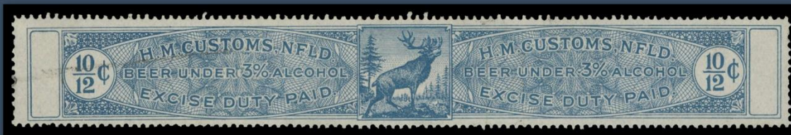
10/12c Beer Stamp, the only known perf 14-13 stamp (Van Dam NFB1a)

A nice selection from first issues to KGVI era including pioneer airmail stamps. One of the very best Newfoundland revenue collections to be offered- Inland Revenues including specialized perfin cancels, rare documents from Queen Victoria to the later Caribou series. Other revenues are also being offered including the unique 1927 Transportation mint set of three, 1938 Beer Stamps including the only reported perforation variety.