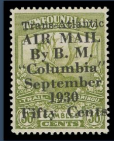
1930 "Columbia Flight, outstanding mint NH; 1998 & 2003 Greene certs.