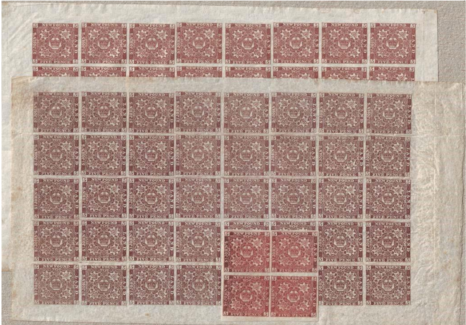
Comparison of underneath large 1861 5d sheet versus topline small 1860 5d sheet. WITH 'certified' 5d block on top and in its same correct printing plated position as well. Shows that going by individual personal colour observations will give the incorrect determination.