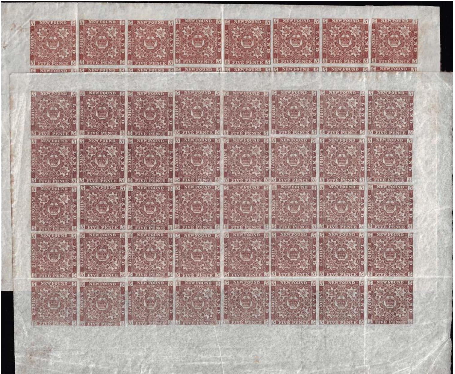
Comparison of underneath large 1861 5d sheet versus topside small 1860 5d sheet.