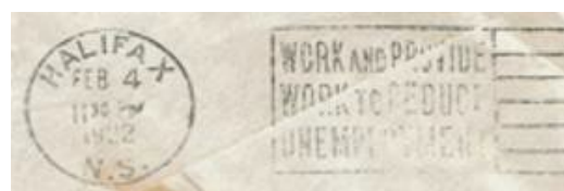
Normal Cancellation seen

While still the correct date, this is a different CDS than was applied to virtually every flown Halifax cover. A connection to Grand Falls origin?