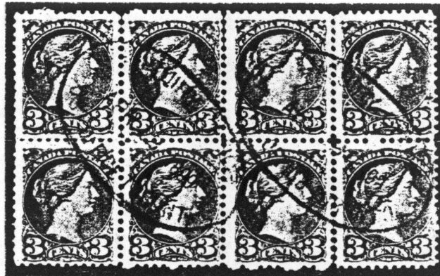
Figure 2. ENQUIRY OFFICE ovals - APR 12 1899.