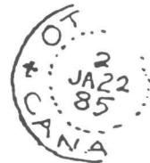
Wally Gutzman #1300.