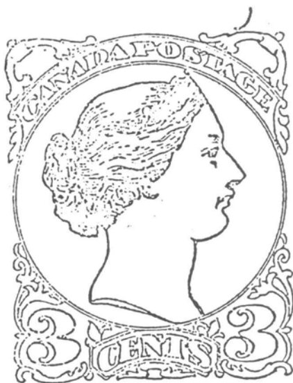
Figure 2 C Hook Above "A" of Postage and Faint Dot above First "A" of Canada.