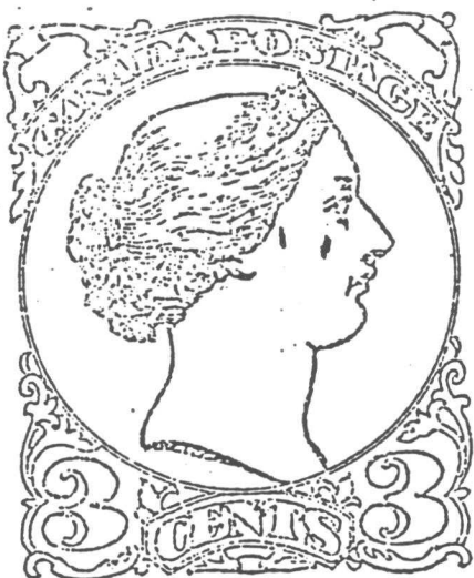
Figure 4 C Two Scars