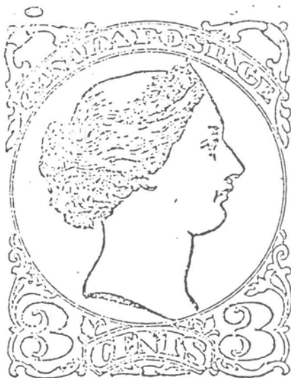
Figure 1 C Oval in U.L. Corner