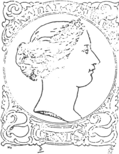
Figure 2 B Staple Variety