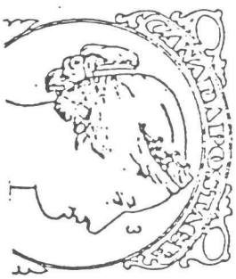
The 1c Value: Four "Strands of Hair" identified