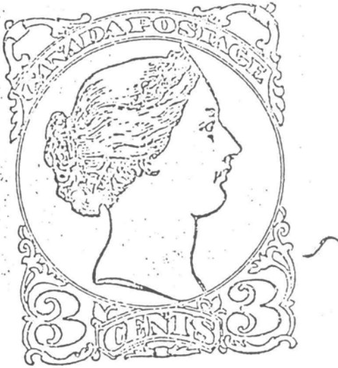
Figure 6 C Offset in L.R. Side