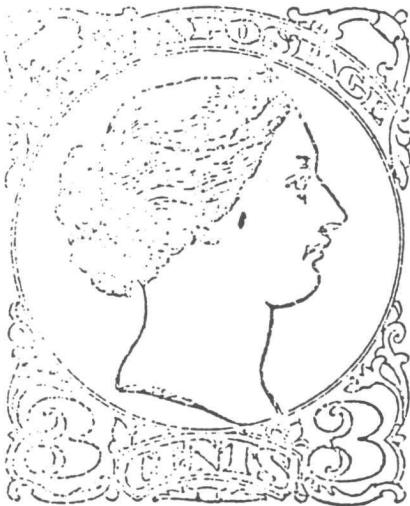
Figure 3 C One Scar