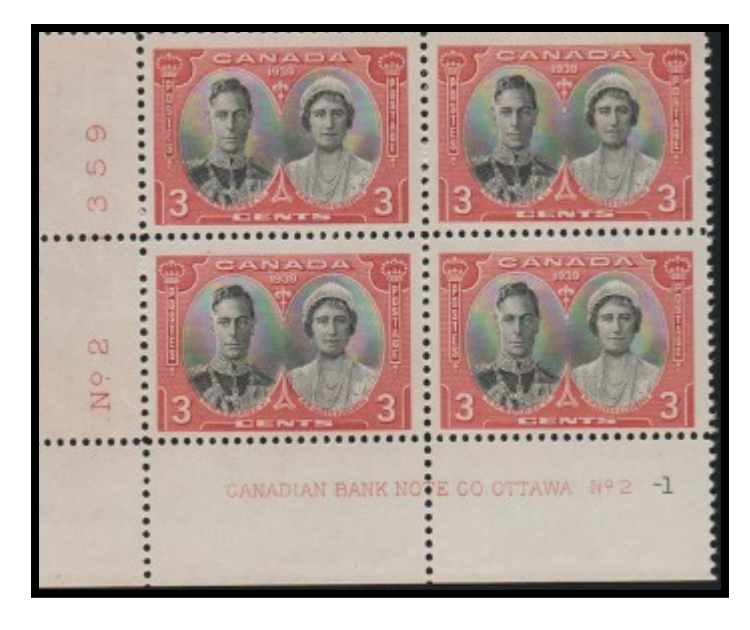
Illustration # 1

The end result was that when the two different plates (duty and face) were used to print on the same sheet of paper, assuming that they were lined up correctly, the coloured plate number of the sheet would be showed immediately to the left of the hyphen and black number of the tint or face plate to form a bi-coloured plate block number (See illustration 1). If they are not lined up, the numbers will be uneven or very close (or very far) from one another.