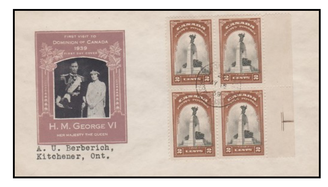
Illustration # 10

A first day cover (May 15, 1939) of the 2-cent monument stamp, showing the two T-Lines or guide lines in the margin. Note that one T-Line is brown in colour from the Duty Plate and the other is black in colour from the Tint Plate. The operator tries to line-up these as perfectly as possible.