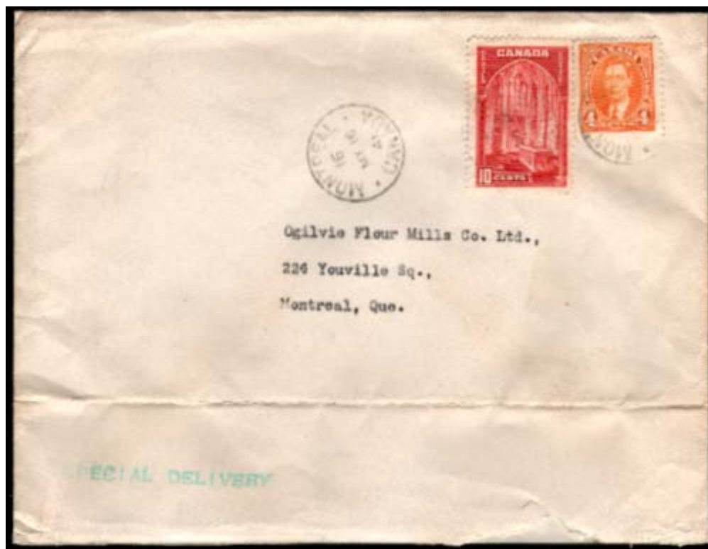
Drop Letter rate cover mailed May 16, 1941 in Montreal for delivery at a 4¢ rate for a Drop Letter of up to 3 ounces.

The cover below is a nice example an overweight Drop Letter paid for up to three ounces with the 4¢ "Mufti" definitive and also franked with 10¢ 1938 Pictorial "Memorial Chambers" to pay the Special Delivery fee. This item is interesting in that it features the 4¢ definitive in a seldom seen use to pay a specific fee, in this case the triple weight Drop Letter rate. The cover has creases along the top, left and bottom edges and a distinct fold, possibly from being a cover of abnormal size and thickness traveling through post office machinery.