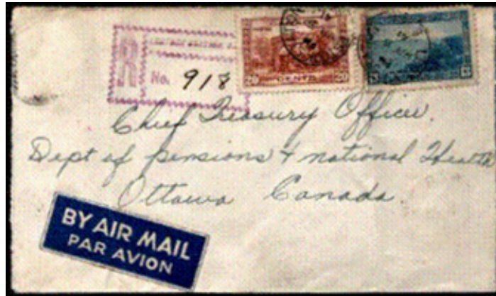
Registered letter (Indemnified for Loss not to Exceed $75) sent on March 5, 1941 from Lestook, Saskatchewan to Ottawa forwarded in part via the Rivers (Manitoba) & Saskatoon RPO - part of the then Grand Trunk Pacific Railway

Mailed from Lestook, Saskatchewan, this cover is an example of a triple registration fee (30¢) to pay for indemnity of up to $75. This type of registered item is seldom seen in that most registration covers are prepaid 10¢ only for indemnity not to exceed $25. Note the Air Mail sticker and if this letter had been sent by air mail, it would mean the 6¢ air mail fee would be required. However the cover has only a further 3¢ fee affixed to meet the domestic first class Letter Forward rate and it appears the letter actually traveled by surface route as there is a RPO cancel back-stamp dated MR 5 41 (RIV & SASK. R.P.O.No. 2) and a received in Ottawa back-stamp dated MR 7 41.