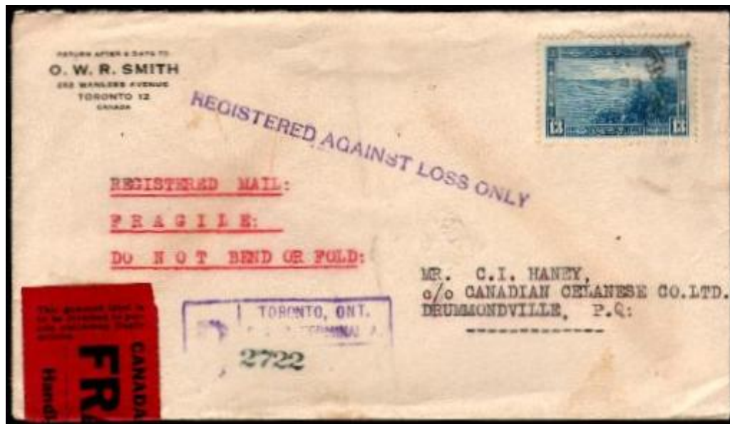
Registered (Against Loss Only) cover mailed October 14, 1939 from Toronto, Ontario for delivery to Drummondville, Quebec franked with the 13¢ 1938 Pictorial to pay the 3¢ domestic first class letter rate plus the 10¢ registration fee

One can only speculate what the sender (O.W.R Smith) had enclosed in the envelope below but, whatever it was, the sender had taken the time to type "FRAGILE" and "DO NOT BEND OR FOLD" in red to highlight the desire for special care in handling the letter. The Post Office in turn affixed its special " FRAGILE - HANDLE WITH CARE " label but also must have advised the sender that the contents were not indemnified as evidenced by the purple " REGISTERED AGAINST LOSS ONLY " purple hand-stamp. A nice example of the 13¢ 1938 Pictorial - Entrance to Halifax Harbour - paid the 3¢ domestic first class letter rate from Toronto to Drummondville, Quebec and the 10¢ Registration fee.