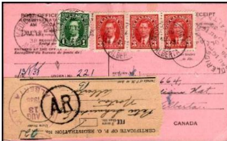
Acknowledgement of Receipt Card sent on Aug 13, 1938 from Medicine Hat, Alberta and received in Coleridge, Alberta on Aug. 16, 1938

A sender could ask for an acknowledgement of receipt sent subsequently to actually mailing a registered letter. In this case, the fee would be 20¢. These are scarce and I am still looking for a domestic delivery AR card for my collection.