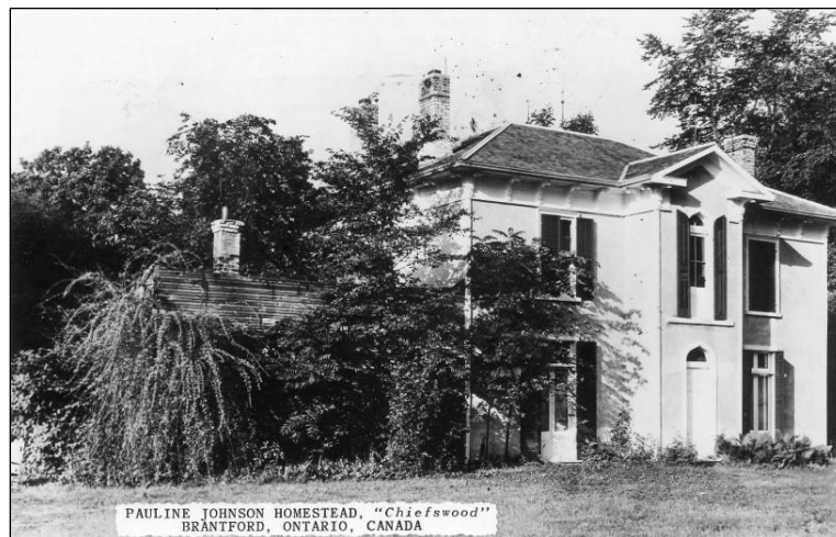
Figure 1. The early Johnson home, Chiefswood

Her native grandfather was a great storyteller, which Pauline used to her advantage as an adult poet and performer. After her father died in 1884, the family moved to a conventional house in Brantford, ON. She wrote and toured throughout North America and Great Britain until 1909. Moving to Vancouver, she passed away in 1913 and is buried in Stanley Park. Dismissed as a minor literary figure for most of the time after her death, she is today recognized as a major figure in the native Canadian feminist movement. Canada Post authorized Brantford to use a special slogan cancellation for her centennial year, which was used to cancel her stamp (Figure 2).