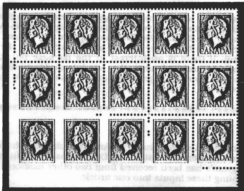
Tagged OP2 4MM - VL Fluorescent paper - PVA Gum

This lower left corner block of 15 from field sheet stock of the 17¢ (green) Queen Elizabeth (Scott # 789) from the 1977-83 British American Bank Note printing shows a dramatic and unusual imperforate error. The regular perforations fade into blind perforations and then disappear completely leaving an almost totally imperforate error on the lower left corner pair.