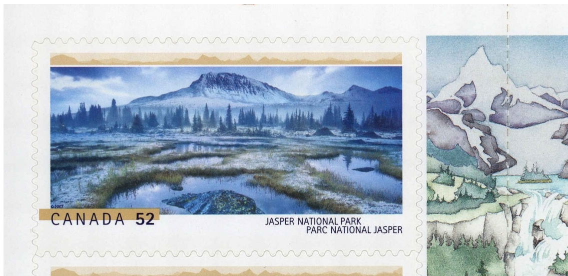
Figure 6 - Enlarged image of the upper left corner of the booklet showing the mountain and the dotted pattern at the right of the stamp

The cover was presented at a Show & Tell of the QEII study group and at a Lower Canada Regional Group Zoom meeting. At both events, no one had ever seen this imperforate stamp, used or new. I would like to hear from the members of this study group if another copy of an imperforate Jasper National Park was observed. I can be reached by email ( l_freve@videotron.ca ) or via the Editor.