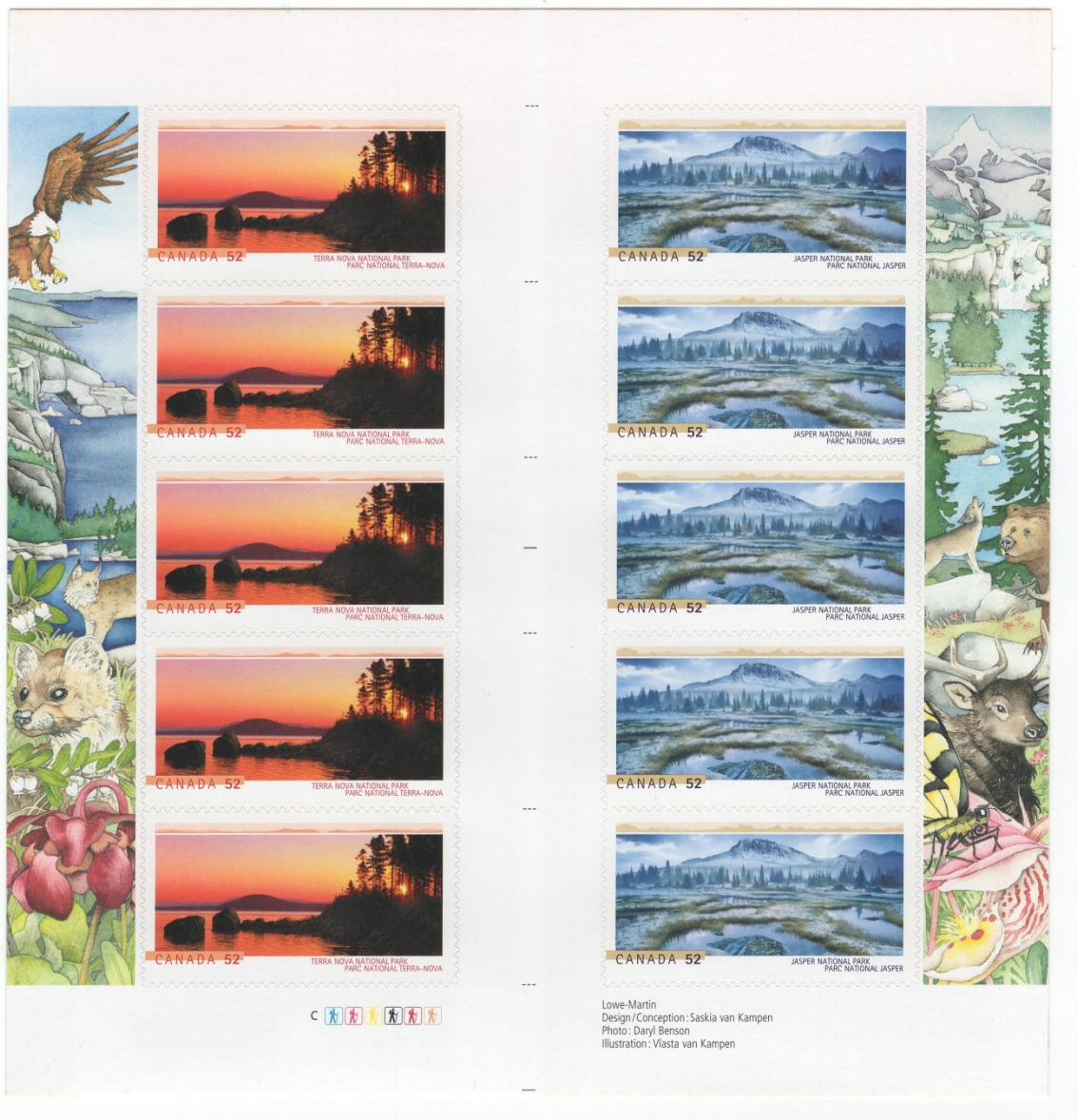
Figure 2 - Gutter pane of Terra Nova and Jasper National Parks' stamps (Sc. 2224b)

Figure 3 shows an imperforate Jasper National Park stamp on a cover mailed from Toronto to Ottawa in January 2008 while Figure 4 shows an enlargement of the stamp. At the right, we can see a dotted pattern. The other borders show traces of scissor cut. No score lines can be observed.