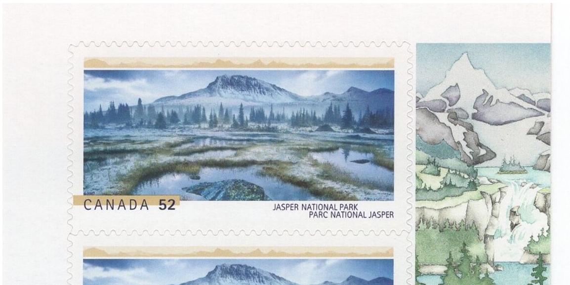
Figure 5 - Enlarged image of the upper right corner of the gutter pane

The image of the mountain in the right border allows us to determine its location: the first row. As the pane (Sc. 2224a) has a straight edge on its right (Figure 5), we also know the stamp does not originate from it. Thus, the dotted pattern present at the right of the imperforate stamp confirms it comes from the left pane of the booklet (Figure 6). Thereby the position of the imperforate stamp is row 1 column 1 in the booklet.