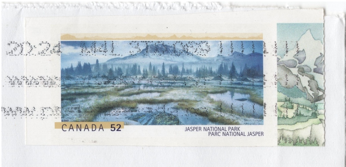
Figure 4 - Enlarged image of the imperforate stamp

The image of the mountain in the right border allows us to determine its location: the first row. As the pane (Sc. 2224a) has a straight edge on its right (Figure 5), we also know the stamp does not originate from it. Thus, the dotted pattern present at the right of the imperforate stamp confirms it comes from the left pane of the booklet (Figure 6). Thereby the position of the imperforate stamp is row 1 column 1 in the booklet.