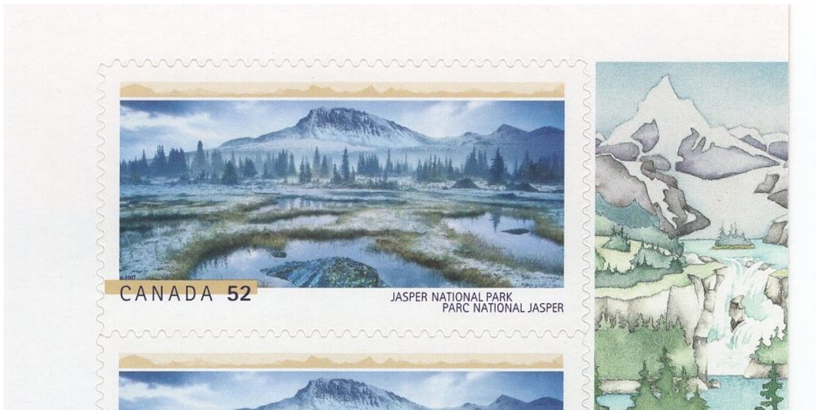
Figure 5 - Enlarged image of the upper right corner of the gutter pane

The image of the mountain in the right border allows us to determine its location: the first row. As the pane (Sc. 2224a) has a straight edge on its right (Figure 5), we also know the stamp does not originate from it. Thus, the dotted pattern present at the right of the imperforate stamp confirms it comes from the left pane of the booklet (Figure 6). Thereby the position of the imperforate stamp is row 1 column 1 in the booklet.