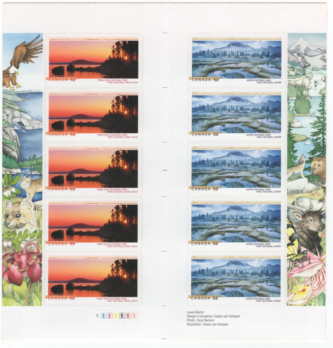
Figure 2 - Gutter pane of Terra Nova and Jasper National Parks' stamps (Sc. 2224b)

Figure 3 shows an imperforate Jasper National Park stamp on a cover mailed from Toronto to Ottawa in January 2008 while Figure 4 shows an enlargement of the stamp. At the right, we can see a dotted pattern. The other borders show traces of scissor cut. No score lines can be observed.