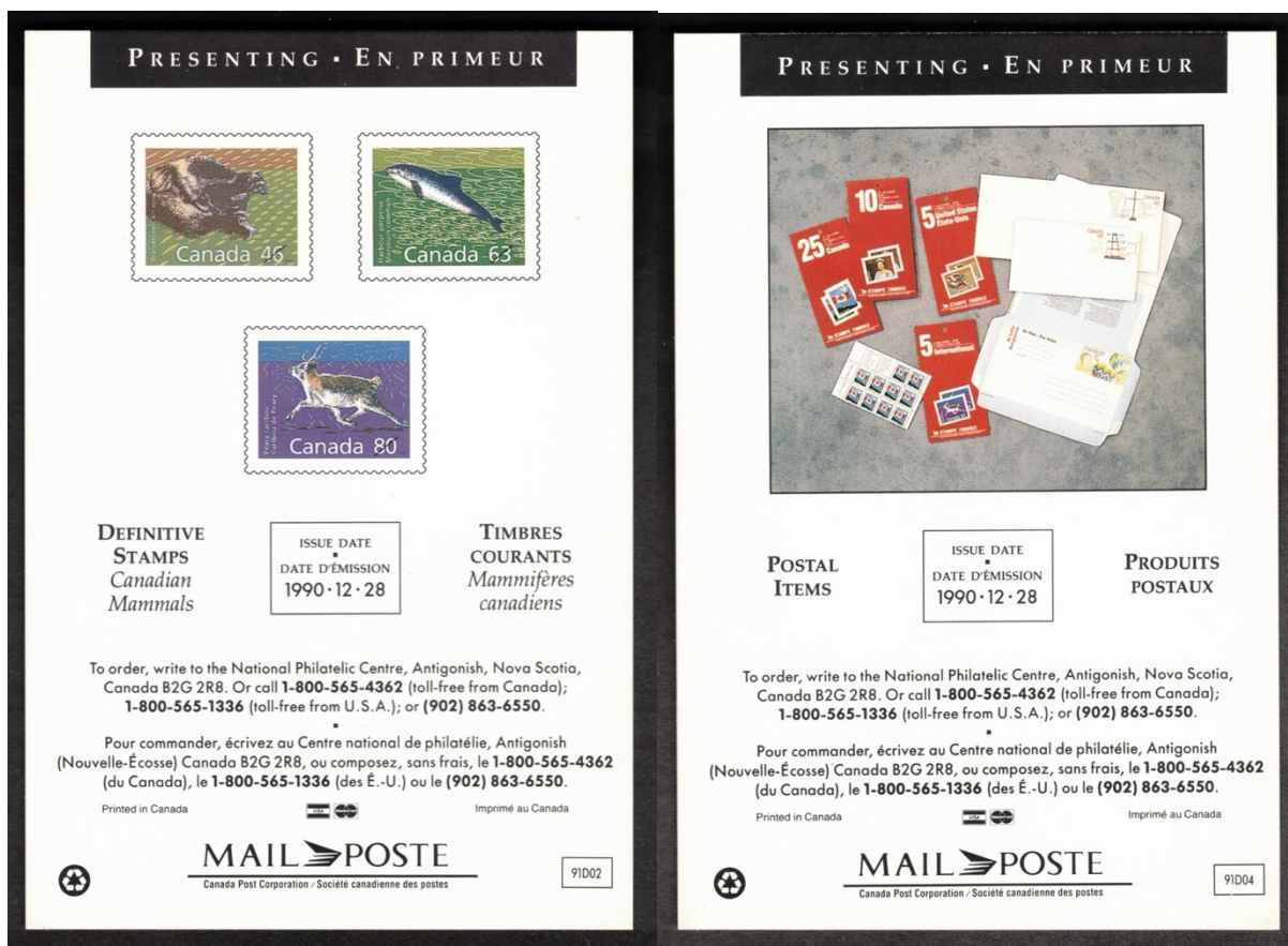
Figure 2 – 91D02 and 91D04 - shown at 75% of original size