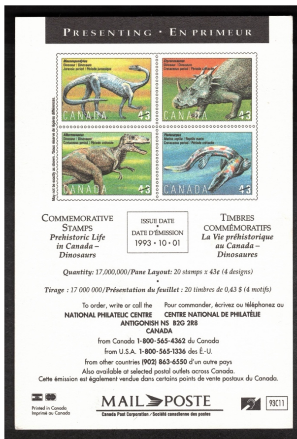
Figure 3 – 93C11 - shown at 75% of original size