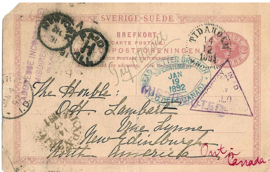
Swedish post card Tidakoln Dec 14 1891 incorrectly addressed thus misdirected to the United States, sent by U.S. DLO/Inspection Division January 5, 1892 (on reverse) to the Ottawa DLO Superintendent's Office Jan 19 1892.

Note space between the 'D and L' and the 'R and B' is actually a '+' as indicated by an enlargement of a high resolution scan.