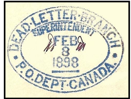
No known strike proof