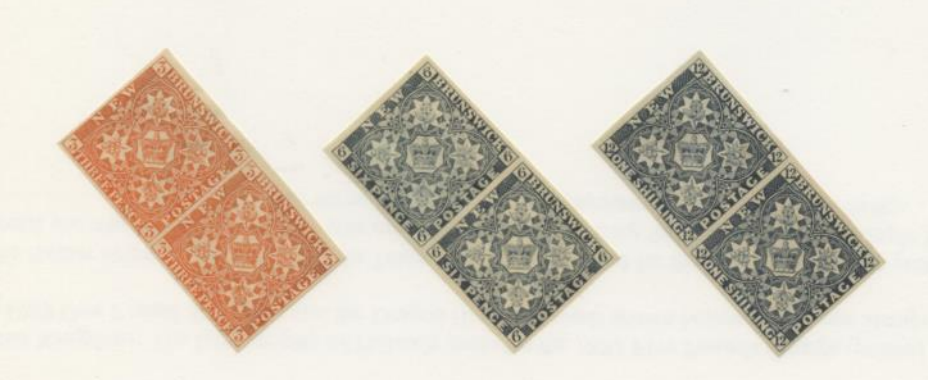
Reprints from original plates (1890). About 700 Reprints of each value were printed by American Bank Note Co. Colours changed, printed on thinner paper than Originals; sheets of 160 stamps, 16 rows of 10.

You can see all pages at Victoria Stamps. www.vicstamps.com