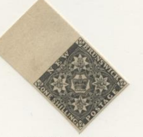
1851 Plate Proof (On card - left sheet margin)

This "diamond" form possibly was inspired to split the two words "New Brunswick", and used again for Nova Scotia. The heraldic theme was centered by "The Crown", with emblems of England, Scotland, Wales and Ireland. Like Penny Blacks, security from forgery was achieved by intricate background patterns generated by Perkin's specialized and patented equipment. The printers economized by re-use of the engraved lathe patterns and vignettes in preparing printing plates for stamp and banknote customers.