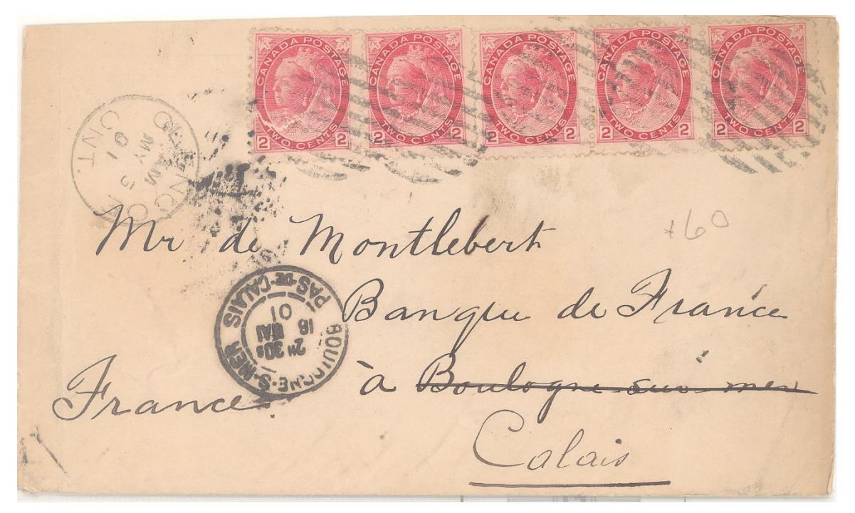
5x2¢Numeral paying double UPU ½ oz. rate to France from Glencoe, Ont. May 3, 1901 to Calais