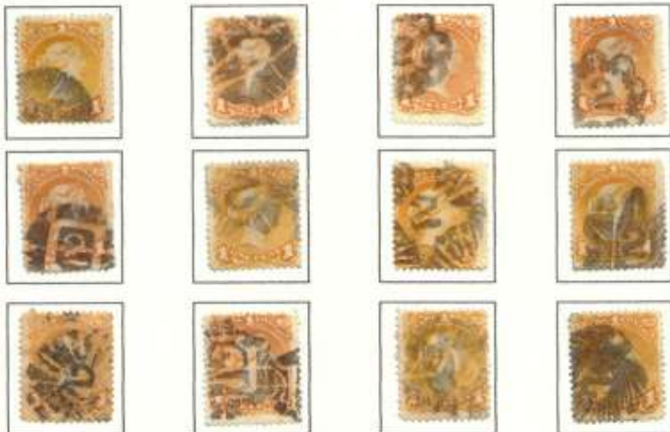
2 in Apple

Upwards of 70 different designs have been recorded, 30 validated with covers