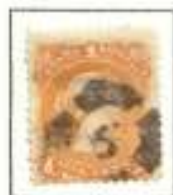
10 – not yet identified