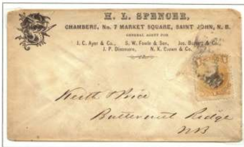
St. John, NB to Butternut Ridge, NB