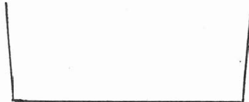
flap type 2

It would be very worthwhile to know what members have - first to determine through photocopies the possible existence of sizes C and D in the second type, and second to establish ERPs for the different sizes and knives