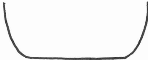
flap type 1

As most Newfoundland collectors know, Newfoundland issued formula registered envelopes. These are unstamped and required postage, but many stationery collectors still include them with other Newfoundland stationery. There are four sizes each labelled A, B, C or D, with A the smallest and D the largest. Aside from paper stock differences - and there certainly are some - there are two fundamentally different types. In my experience, the commoner type has a rounded flap with a printer's imprint underneath it. This certainly exists in all four sizes. The less common type in my experience has a "square" flap without printer's imprint beneath it, and shows a different typeface. I have found this, to date, only on sizes A and B.