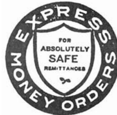
Type C various shades of blue or in black