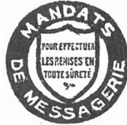
Type E in French, colour in blue