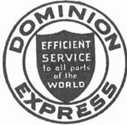
Type D in black