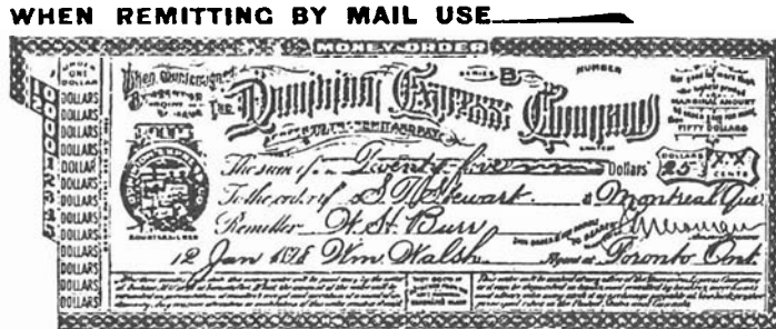
Type A Facsimile money order Series B