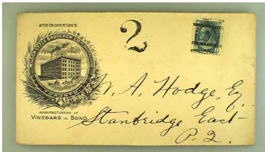
Stamp on cover