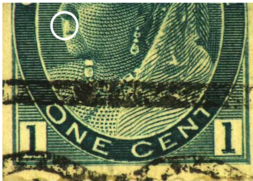
Enlarged view of variety