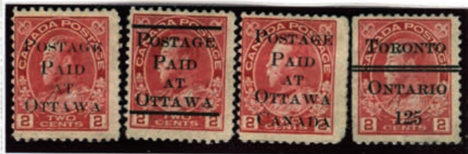
MILITARY ? Unlisted