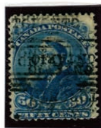
TORONTO 2-47 Y