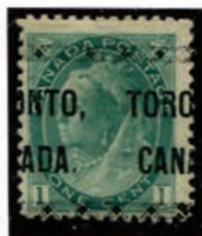
TORONTO 1 - 75 3 Known Copies