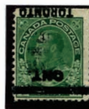
TORONTO 8-104ID 2nd Impression Traces