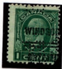
WINDSOR 3-195D J2 Double Partial Perfin