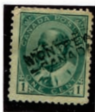
MONTREAL Unknown 2nd Impression Traces