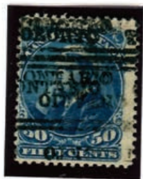
TORONTO Quadruple 2-47R