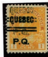
QUEBEC 3 - 105 d D