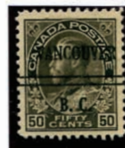
VANCOUVER 2-120 Unlisted Shade