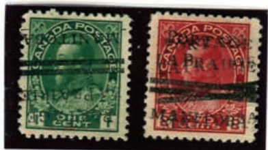
PORTAGE LA PRAIRIE Unlisted