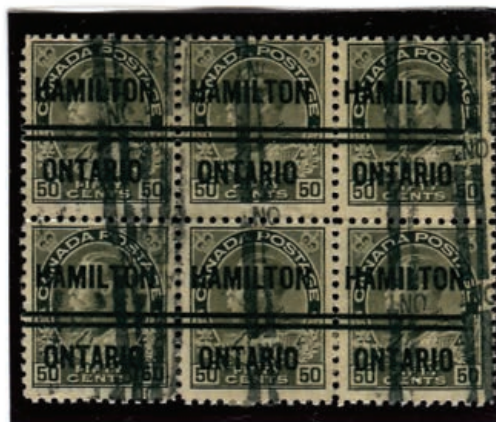
HAMILTON 4 - 120 + Double Vertical Roller