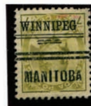
WINNIPEG Hybrid Type I & II Invert