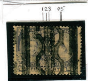
Bar Type U-60V Quintuple