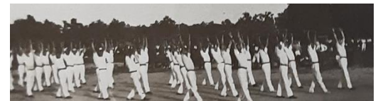
Czech soldiers exercising during their train trip across Canada following the Russian Revolution.

across Canada after World War I; and mail to and from Royal Canadian Navy personnel during World War II. The 1997 article concerns mail handling for Armed Forces personnel helping out during the devastating floods on the Red River near Winnipeg that year.