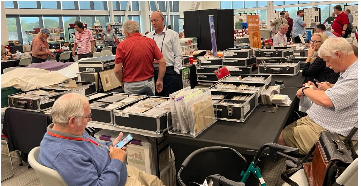
The bourse – even more popular than the bar.