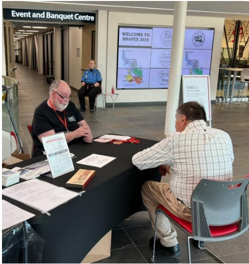
Quiet time at Registration