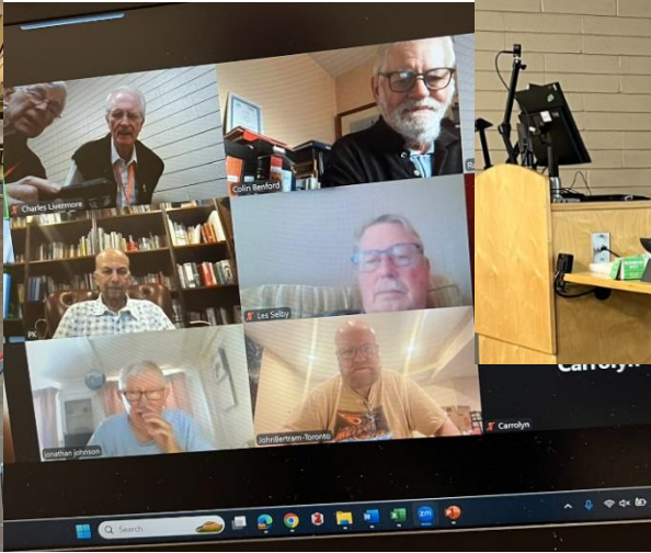
Several Study Groups Zoomed live to distant members