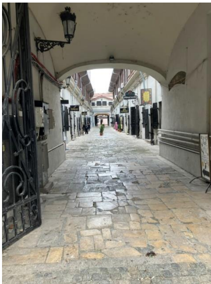
Street in Old Town Bucharest (left)