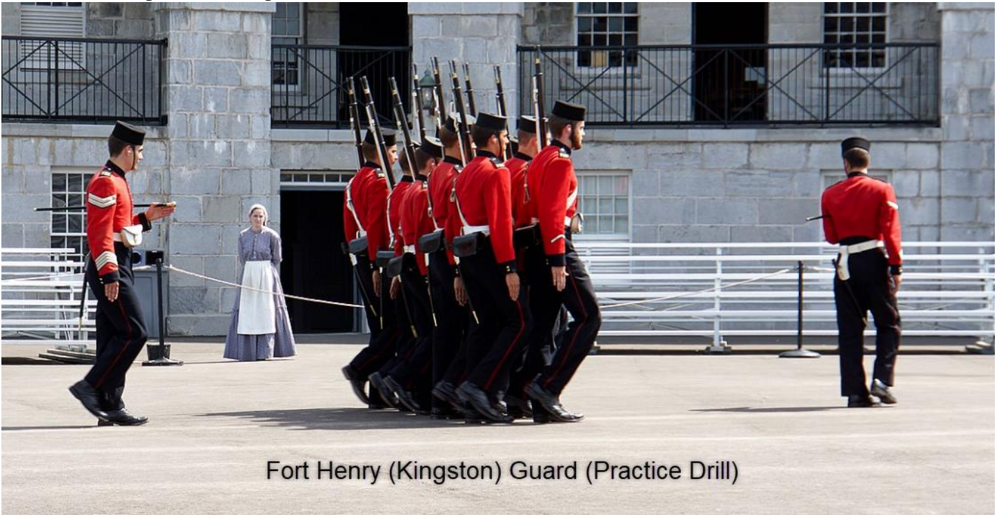
Fort Henry (Kingston) Guard (Practice Drill)

Seminars & Meetings - Only 3 time slots remain available in each of the meeting rooms. Seminars and meetings which have been requested as hybrid meetings are now noted on the schedule in green highlight and in some cases the speaker and topic are now listed.