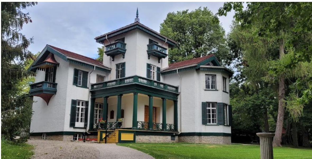
Bellevue House (Kingston) National Historic Site Home of Canada's first Prime Minister, Sir John A. Macdonald