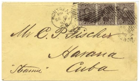
Letter rate to Cuba via U.S. was reported in Canadian Almanac at 15¢ for ½ oz. 1859-1863. This cover was postmarked Montreal DE 18 61 and thus paid double letter rate.