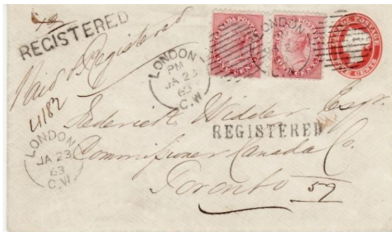
Seven-cent domestic registered rate with Nesbitt 5 ct. franking and 2 X 1 ct for registration.

through other auctions and dealers. I don't believe that Firby had photocopies of all of the decimal and pence covers and back in the time of his collecting it wasn't as easy to send scans or photos over the