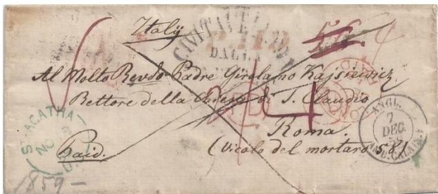
Letter sent from St. Agatha, U.C., Nov. 1859 to Papal States in Rome, Italy. Postage paid was 2 shillings and 4 pence (in manuscript). Transit markings on front and reverse.

additional information which you feel would be helpful to classify the cover for example, the rate to the destination, postmarks that would help understanding the route. I would put the information into an easily understandable format that may help other decimal postal history collectors. I would keep you posted through the Pence-Cents Newsletter on my progress of populating the tables with information. I would not identify you unless you wanted a citation in the census.