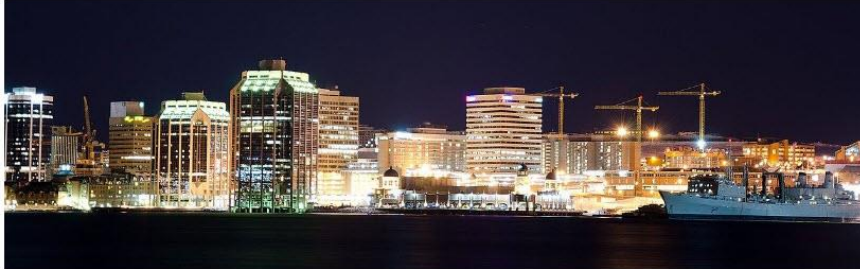
Halifax skyline at night